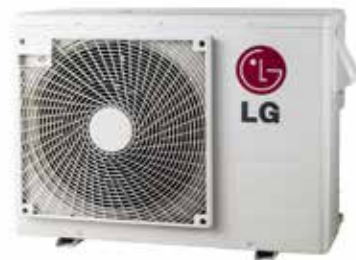
Duct air condition