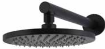
Black matte shower head