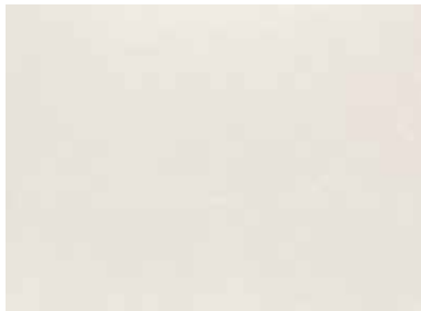
Contact White ceramic tile