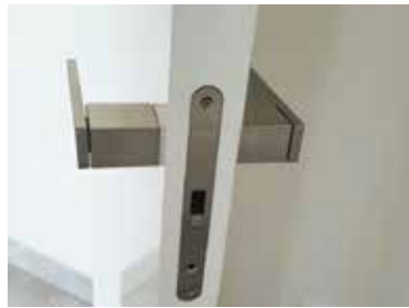
Hoppe door handles