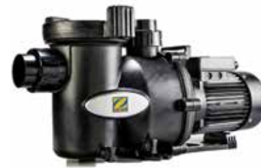
Zodiac pool pump