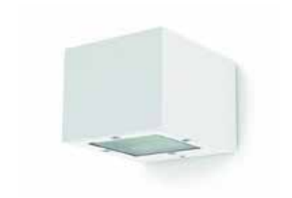
Up and downlight