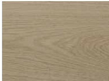
Timber Nut ceramic tile